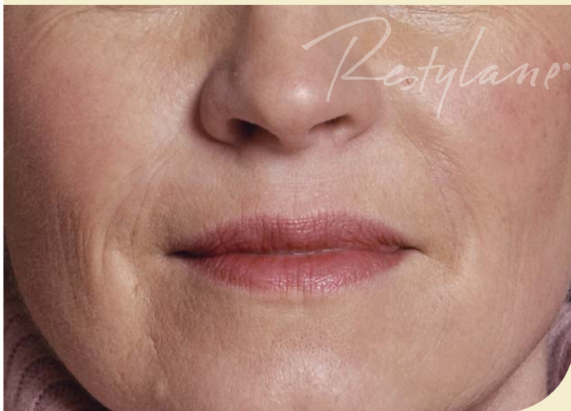
After treatment with three Restylane® 0.7 mL syringes