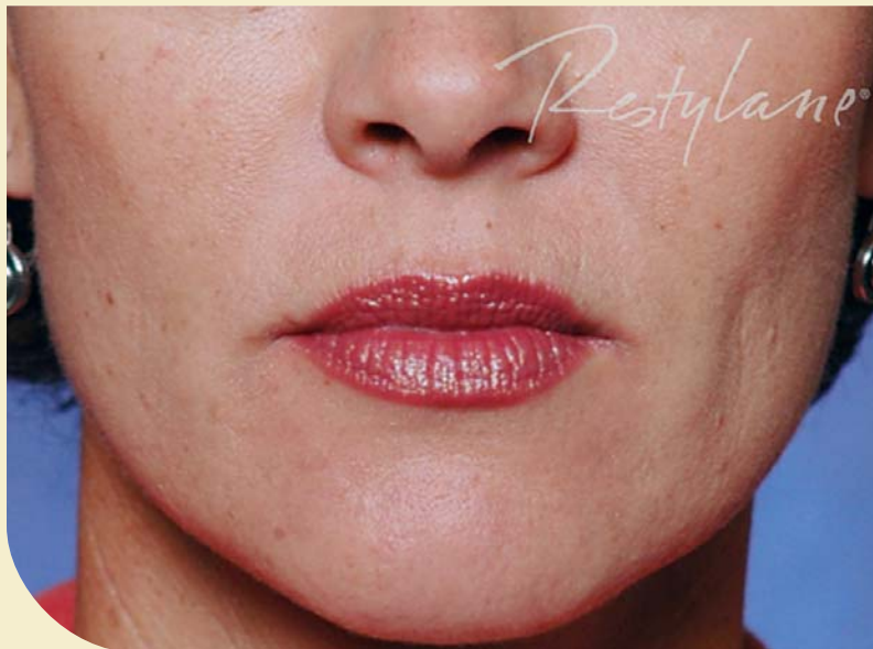
After treatment with two Restylane ® 1 mL syringes