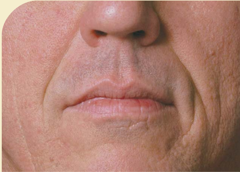
Nasolabial folds before treatment