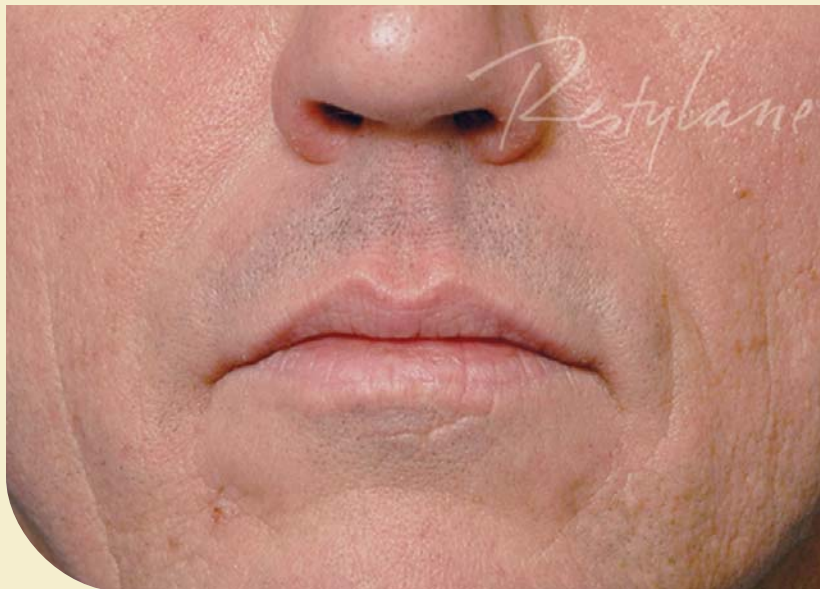
After treatment with two Restylane ® 1 mL syringes