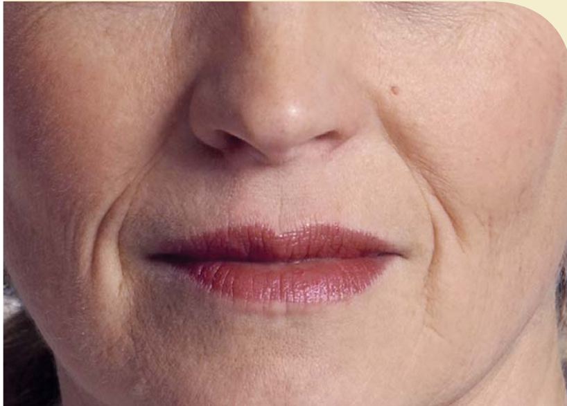
Nasolabial folds before treatment