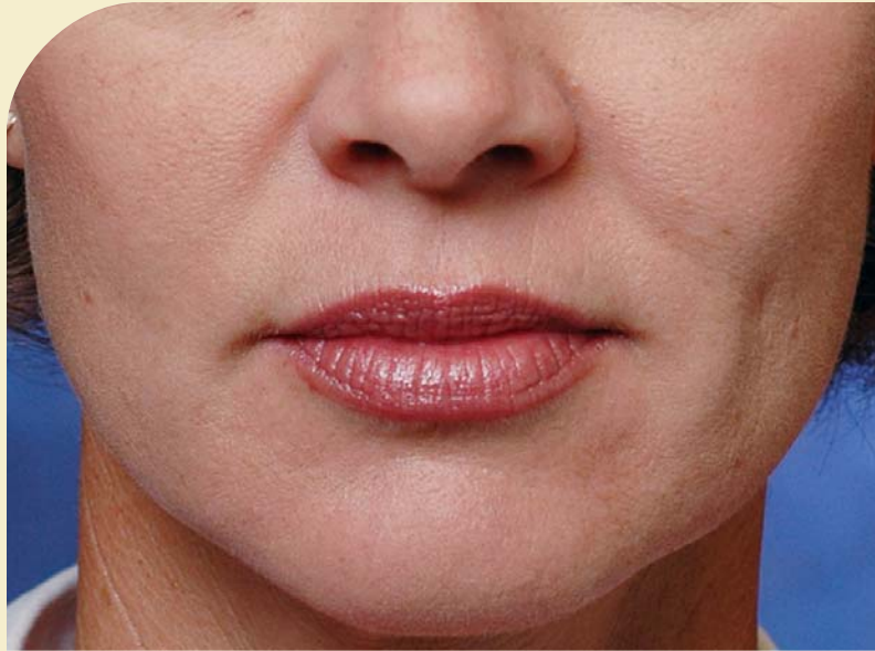
Nasolabial folds before treatment